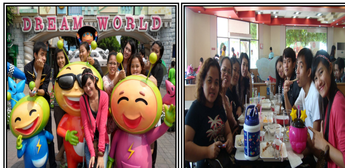
Tal with other trainees and staff at Dream World during their one of team building trips